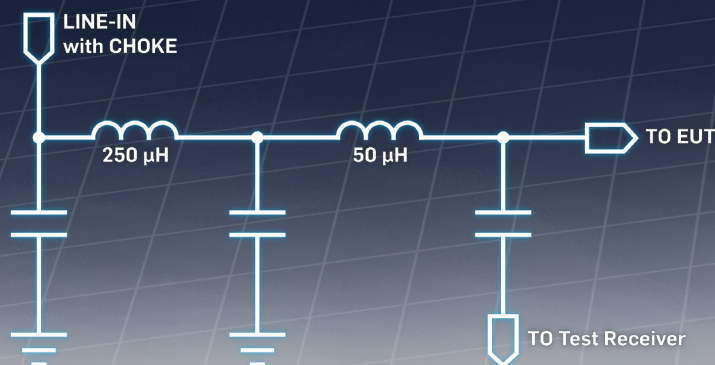
L3-100 equivalent circuit