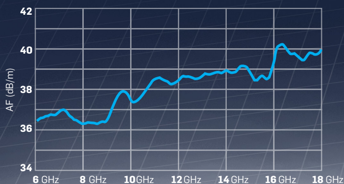
DR-01 - Antenna Factor