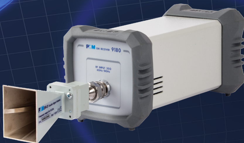
DR-01 Installed on EMI Receiver model 9180