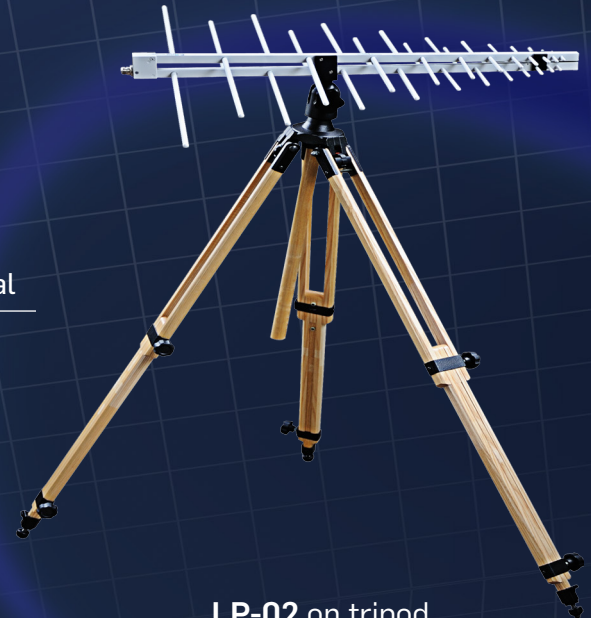
LP-02 on tripod