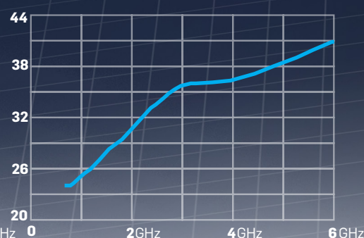
LP-03 - Antenna Factor