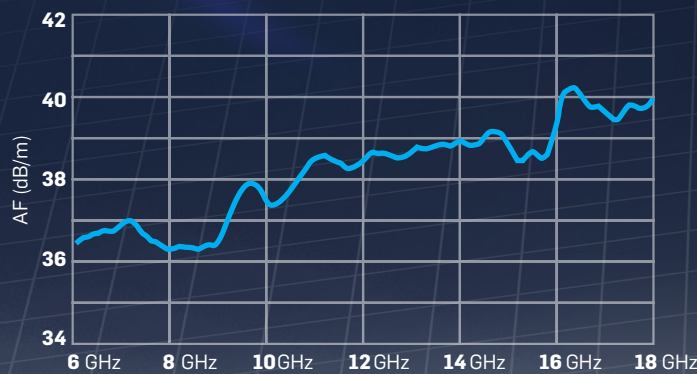
DR-01 - Antenna Factor