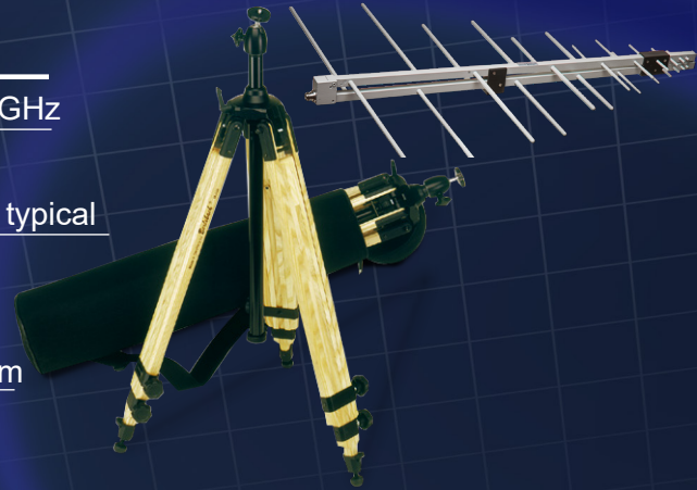
LP-04 and tripod